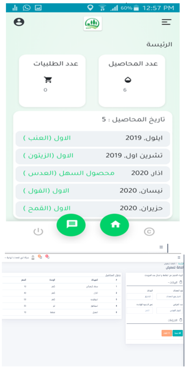
Figure 4. The page to list the available agricultural products and add a new gallery

In this way, the merchant can search for and order agricultural products (Figure 4).