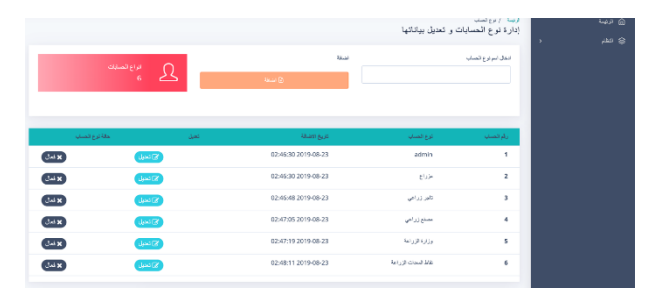
\label{eq:Figure 3.} \textbf{ The page for managing accounts.}