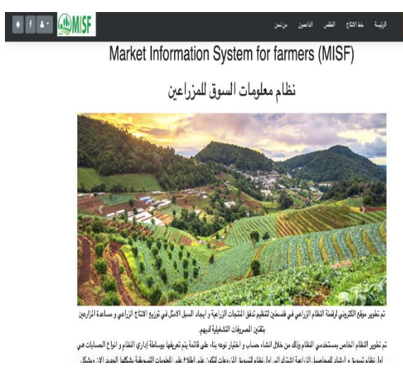
Figure 2. The homepage of the system

The system was developed for the different stakeholders, for the farmer, agricultural trader, agriculture production factory, Ministry of Agriculture, agriculture directorate, and agricultural supplies selling points. The system is accessible through smartphones and computers.